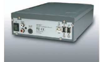
Speedzter 5 back panel